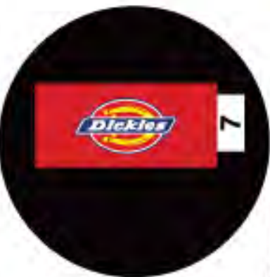
INSIDE WAIST LABEL