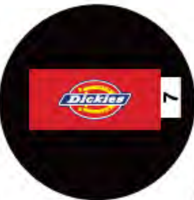
INSIDE WAIST LABEL